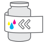
Print & Apply